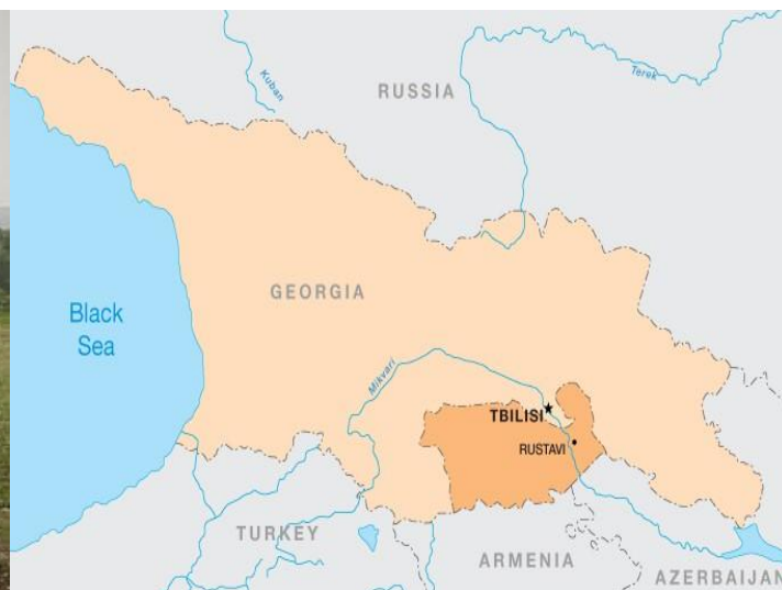
Map of Georgia. Kvemo Kartli region