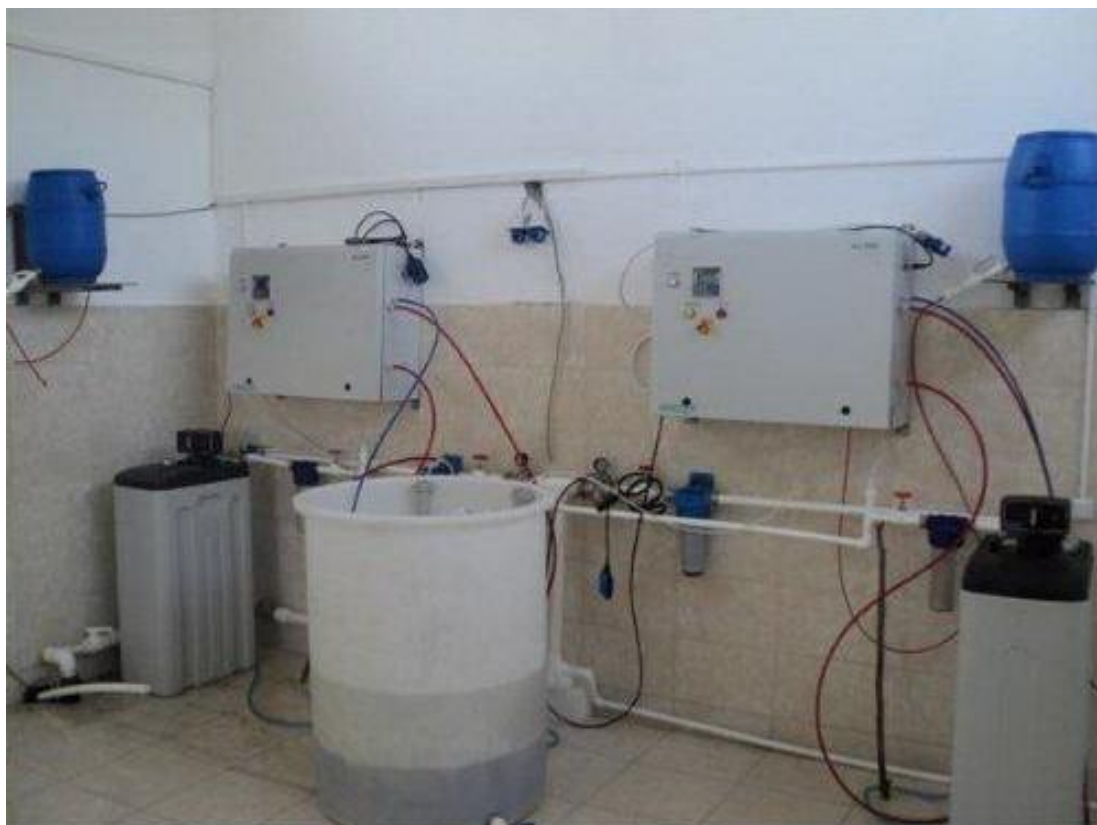
ELA-2000s with brine tanks, water softeners and anolyte tank

It's worth mentioning that after project completion water supply problem will be solved for Sartichala population, therefore project implementation is a very important issue for locals.