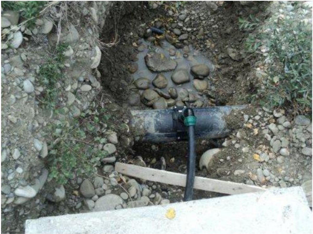
Anolyte injection point