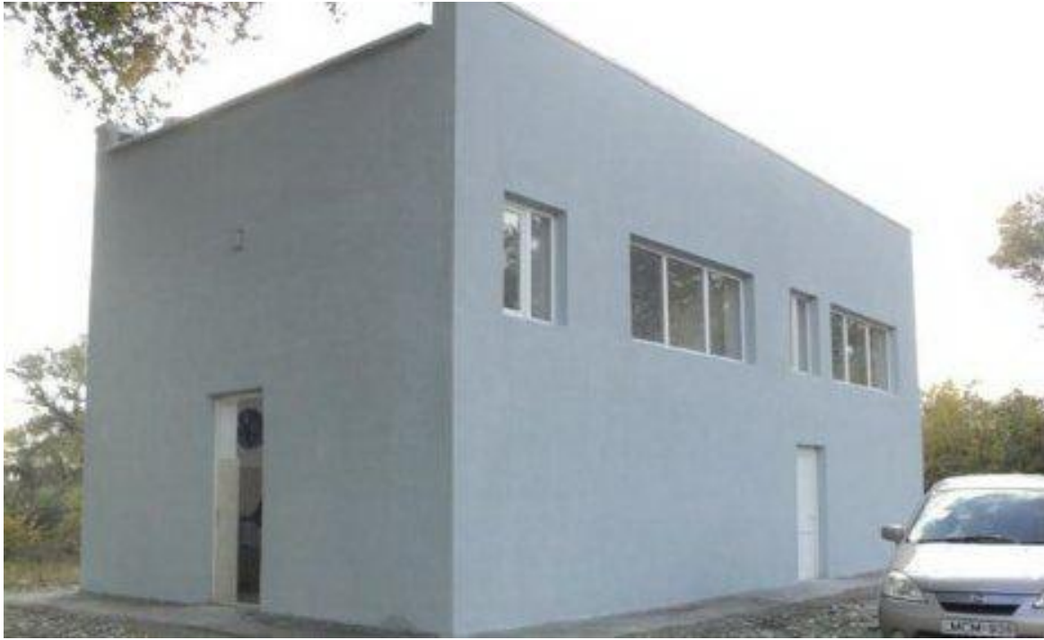
Water purification station